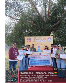
Participated in the Meditation and Ahimsa Run on 21.12.2025