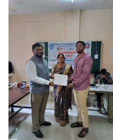
Blood Donation Camp on 21.11. 2025