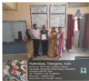
MoU with Deccan Positive Mental Health Practitioners (DPMP) on 28.01.2026