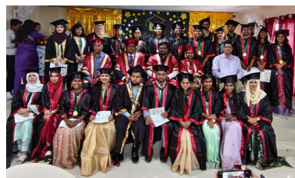
Farewell was organized for the VIth Year Pharm.D students of the 2019–2025 batch on 20.09.2025