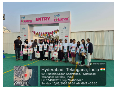
Pinkathon marathon organised by zyus to create awareness against cancer on 15.02.2026