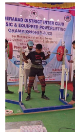
B.Pharm student awarded Gold medal for powerlifting in Hyderabad district Inter-club championship in March, 2025