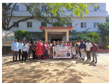
Unity March was organized on 31.10.2025