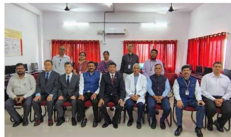
MoU with Japan Education Centre and Information (JECI) on 07.03.2025