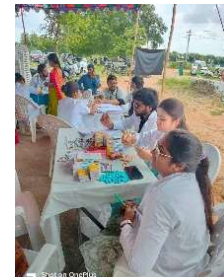
Medical camp conducted on 04.08.2025