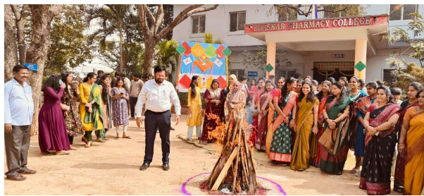
Sankranti celebrations were held on 12.01.2026