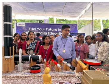
Participated in Project Expo held at Gachibowli Indoor Stadium on 28.02.2026