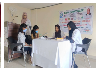
5th National Pharmacovigilance Week 2025 was celebrated from 17th to 23.09.2025