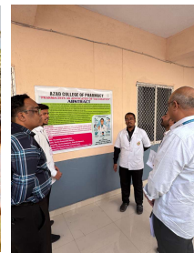
64th National Pharmacy Week celebrations were held from 17th to 23.11.2025