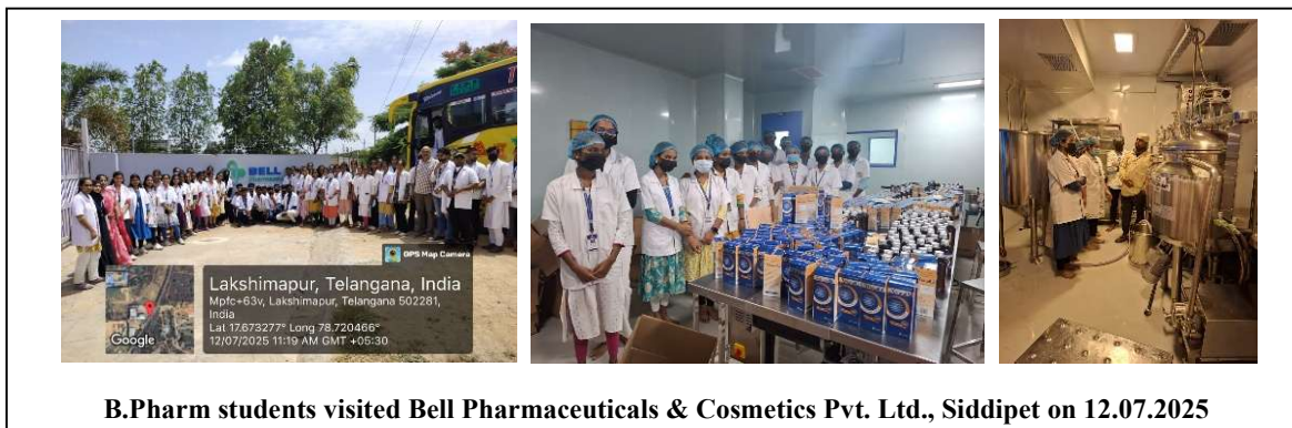
B.Pharm students visited Bell Pharmaceuticals & Cosmetics Pvt. Ltd., Siddipet on 12.07.2025