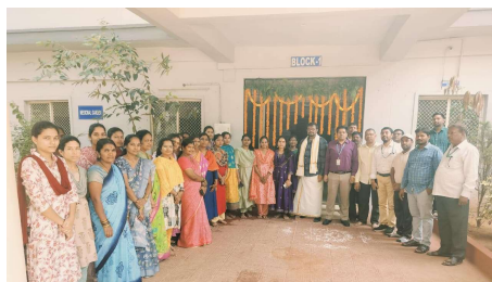
Dussehra Pooja was conducted on 01.10.2025