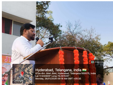
77th Republic day celebrations on 26.01.2026