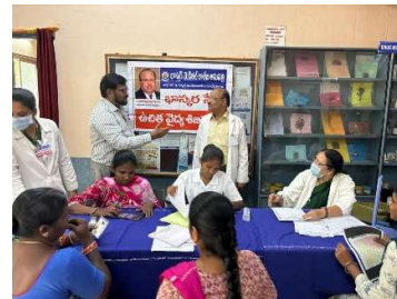
Free health camp was organized on 09.10.2025