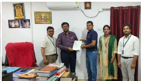
MoU with 100 Transcripts LLP on 12.12.2025